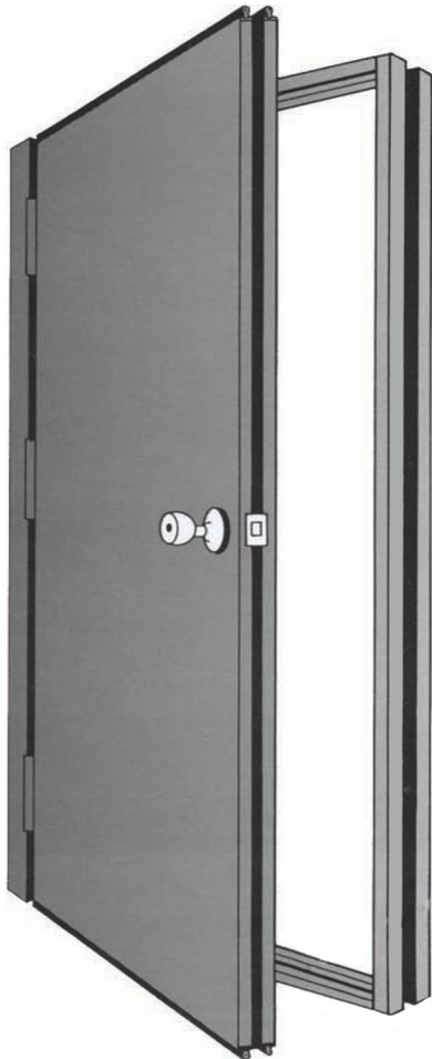
CB•SS Series Thermally Broken Stainless Steel Door

CannonBall's CBSS entry door features a thermally broken panel and frame to provide excellence in energy savings. The door is constructed 100% of stainless steel along with a 16-gauge stainless steel frame, making it ideal for high moisture environments such as animal confinement.