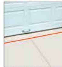
Walks/Driveways and concrete joining other materials