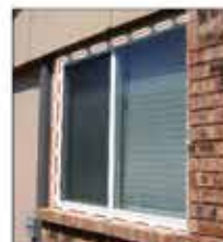
Window Casings and other finished areas