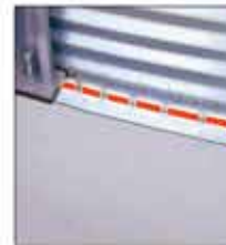
Sill Plates and ground level water seams