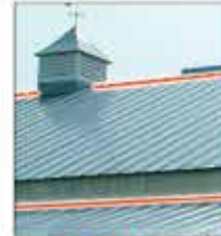
Metal Roof and other metal construction junctions