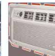
AC Window Units

...hundreds of other uses and applications