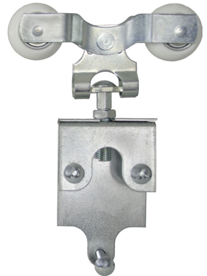
Assembled Trolley Reference Image